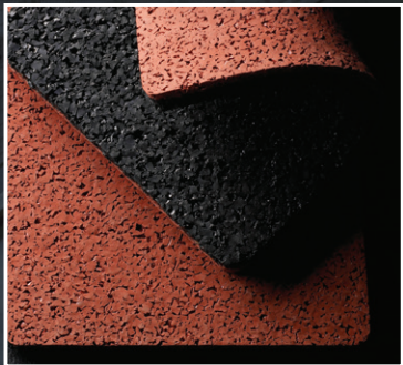
KO101 Brick Red