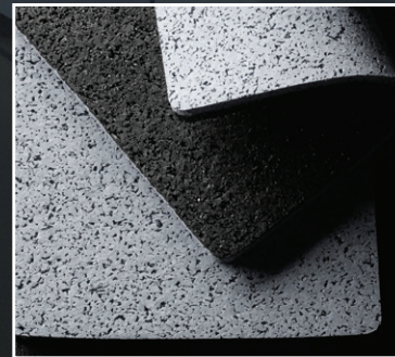
KO103 Light Gray